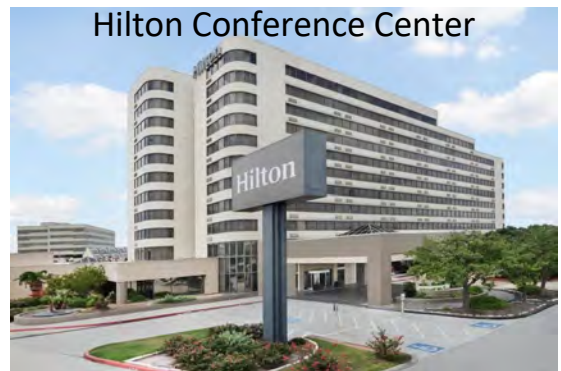
Hilton Conference Center

February 21 & 22: Scientific program and Vendor fair at the Hilton College Station & Conference Center