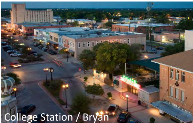
College Station / Bryan

February 21 & 22: Scientific program and Vendor fair at the Hilton College Station & Conference Center