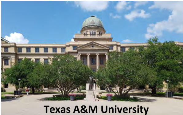
Texas A&M University

February 20: Workshop at Texas A&M University Microscopy and Imaging Center & Materials Characterization Facility